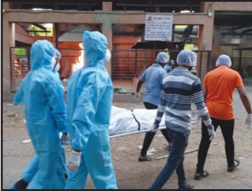
On ground support to Pune Municipal Corporation by working in Cremation Ghat