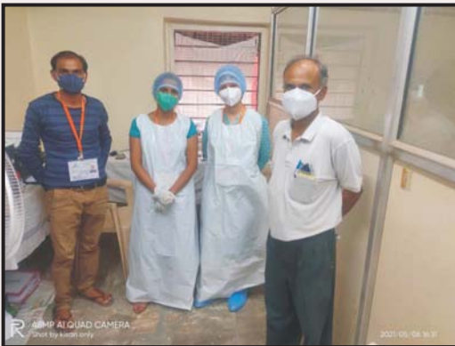
Death certificate Centre in Sassoon Hospital