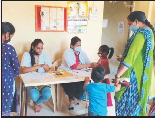
Health Camp for Children (Pakoli)