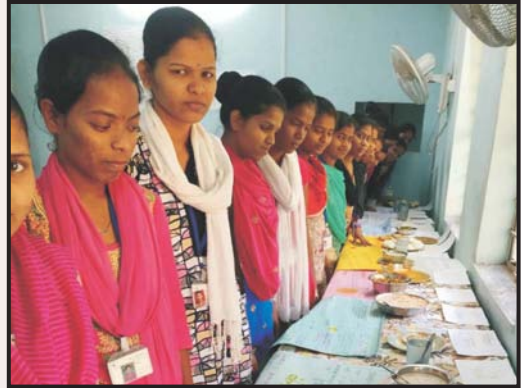
Patient assistance Course