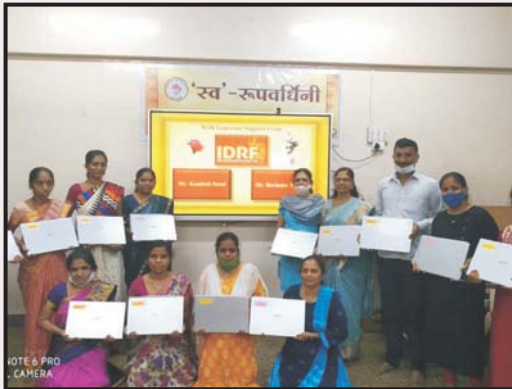
Mahila Vibhag - Laptop Distribution