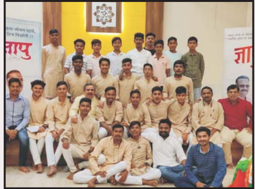
Independence Day 2021 - Elocution Contest