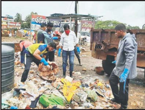
Chiplun Flood Relief