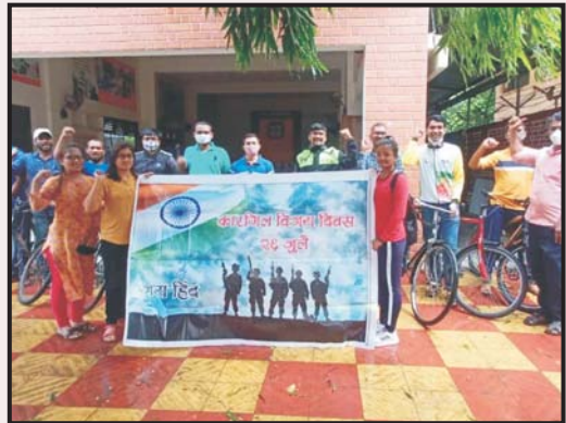
CEC Students - Cycle Rally