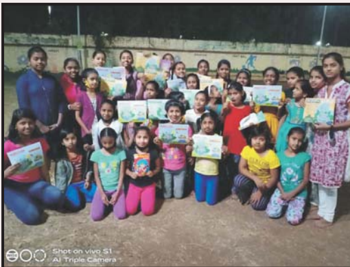
Distribution of Vardhan Pustika