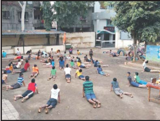
Shiva - Surya Din