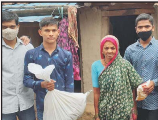
Distribution of Grocery Kits in rural areas