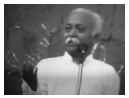
The development of human being is incomplete ,if the development of the society is forgotten.